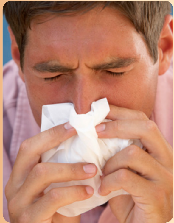
What You Need to Know

A little-known side effect of the heartburn drug cimetidine is that it inhibits the production of T-suppressor cells . 2 In doing so, it boosts immune function by preventing the immune system from turning itself down.